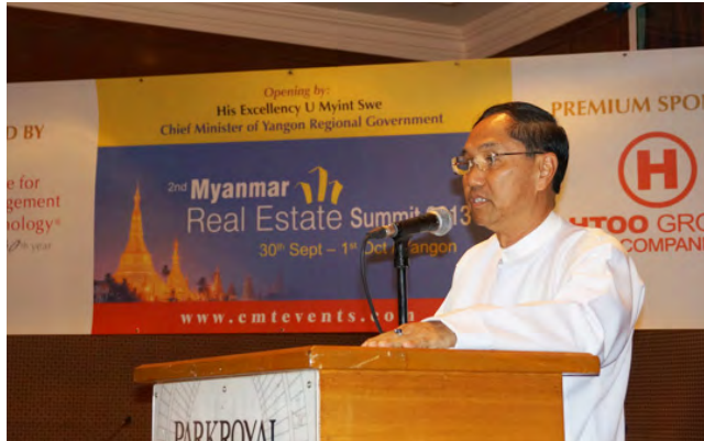
Opening Ceremony by: His Excellency U Myint Swe Chief Minister of Yangon Regional Government

CMT's 2nd Myanmar Real Estate Summit (MRES) 2013 witnessed an array of high-profile speakers, sponsors, exhibitors and delegates. The event was inaugurated by His Excellency U Myint Swe, Chief Minister of Yangon Regional Government, while there were two Keynote Speeches – one by His Excellency U Hla Myint, Mayor of Yangon City Yangon City Development Committee (YCDC) and another by His Excellency U Aung Moun, Mayor of Mandalay – Mandalay City Development Committee (MCDC).